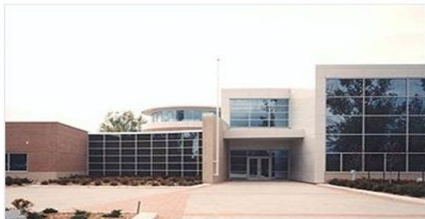
Canadian Forces Health Services Training Centre

CF H Svcs Gp partners with civilian health facilities throughout Canada to provide clinical education for students studying to become physician assistants, and it also provides specialty courses in critical care, operating room procedures, and mental health services for nursing students. The TC collaborates with civilian colleges and institutions throughout Canada to provide occupational training for the following occupations: