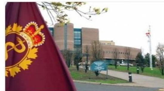
Canadian Forces Health Services Centre (Ottawa)