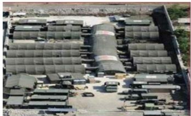
1 Canadian Field Hospital Haiti