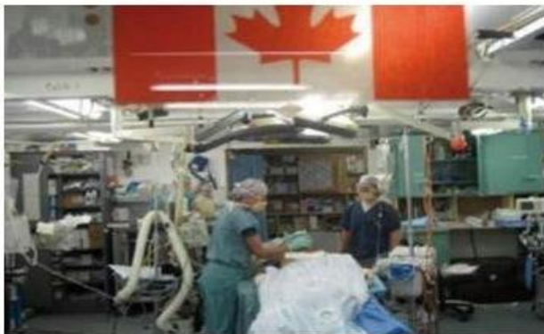
Role3MMU Operating Room Afghanistan

CF H Svcs Gp currently supports 15 international missions. CF health planners supporting the operational commands establish health services appropriate to diverse operational environments, such as the jungles of Central Africa, the deserts of the Middle East, and aboard ships off the Horn of Africa and in the Arabian and Caribbean Seas. For almost four years beginning in 2006, CF H Svcs Gp commanded and provided most of the staff for the NATO Role 3 Multi-national Medical Unit (R3MMU) in Kandahar. It provided tertiary care to coalition forces involved in combat operations in southern Afghanistan and was widely considered one of the best trauma hospitals in the world with a 97% casualty survival rate.